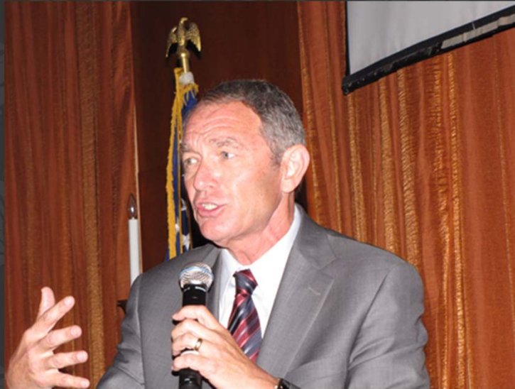
Mark Levin, speaking to MLH Leaders on 10 Things All Successful Leaders Must Do