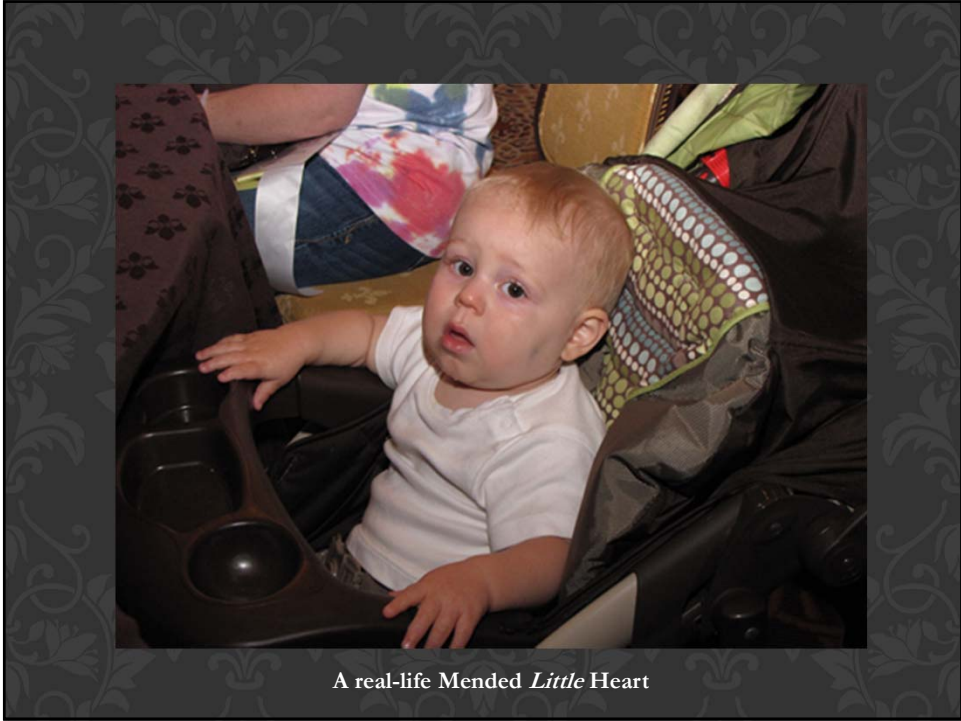
A real-life Mended Little Heart