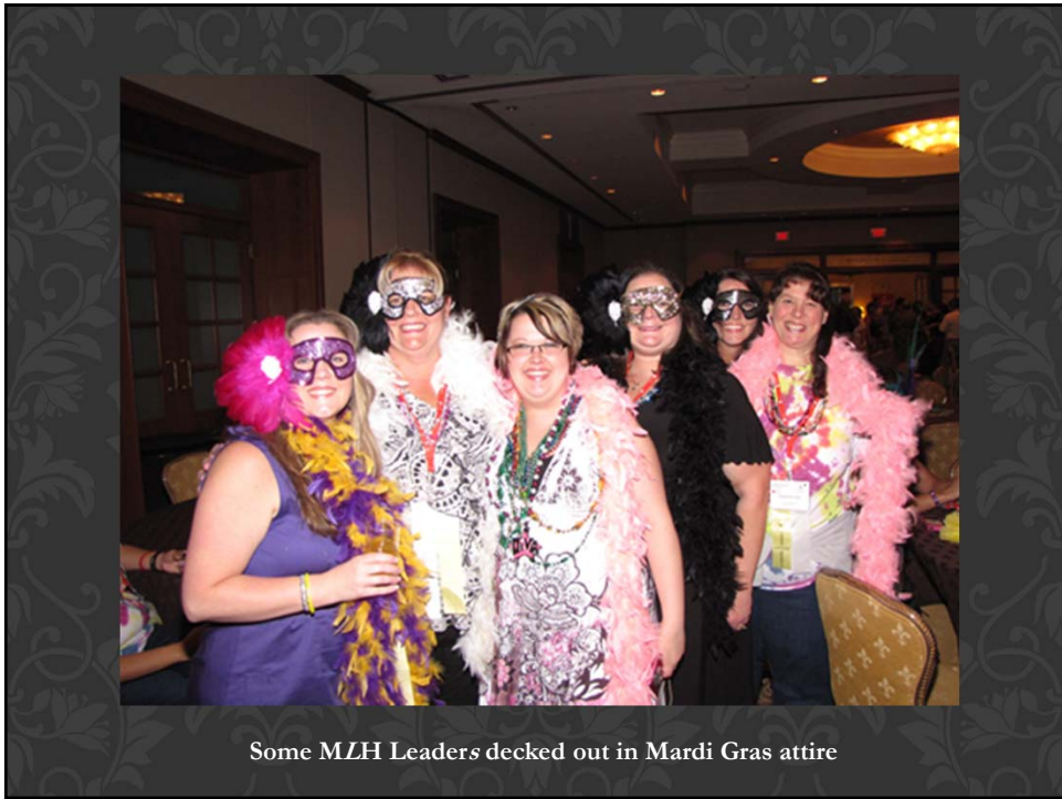
Some MLH Leaders decked out in Mardi Gras attire