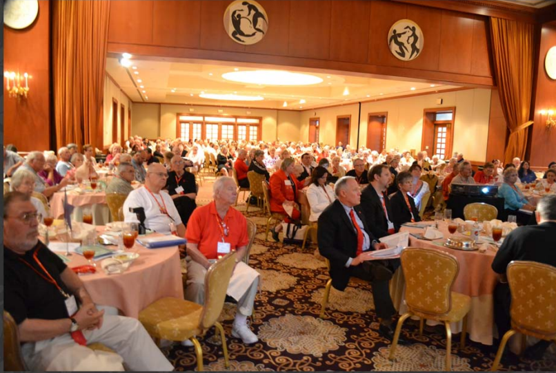
Members listen attentively to an educational General Session presentation.