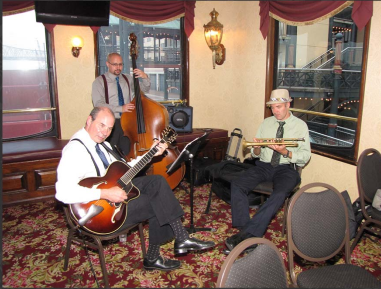
Members were entertained by musicians aboard the Creole Queen.