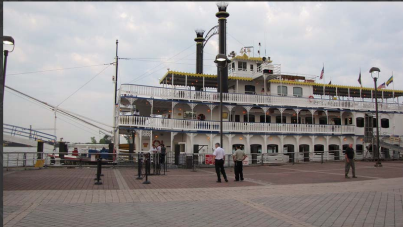
“Creole Queen” Mississippi River paddleboat awaits our arrival for Opening Dinner Cruise.